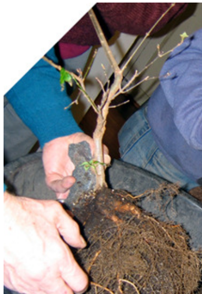
2. Tom Post, February 2010 Note root growth