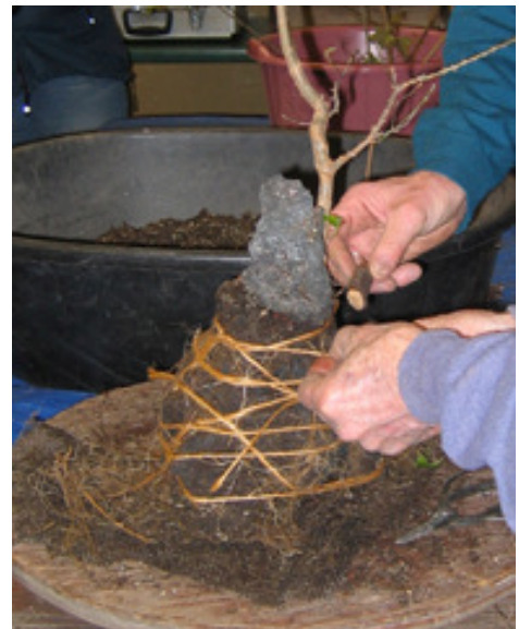
3. Tom Post, February 2010 Showing twine around rock